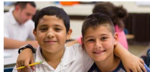
The Summer Learning Recruitment Guide is also

Research shows that students with high attendance in quality summer learning programs gain an advantage in math and reading. But getting kids to sign up for voluntary summer learning programs isn't easy. In this guide, you'll learn from five school districts how to launch a summer learning recruitment effort.